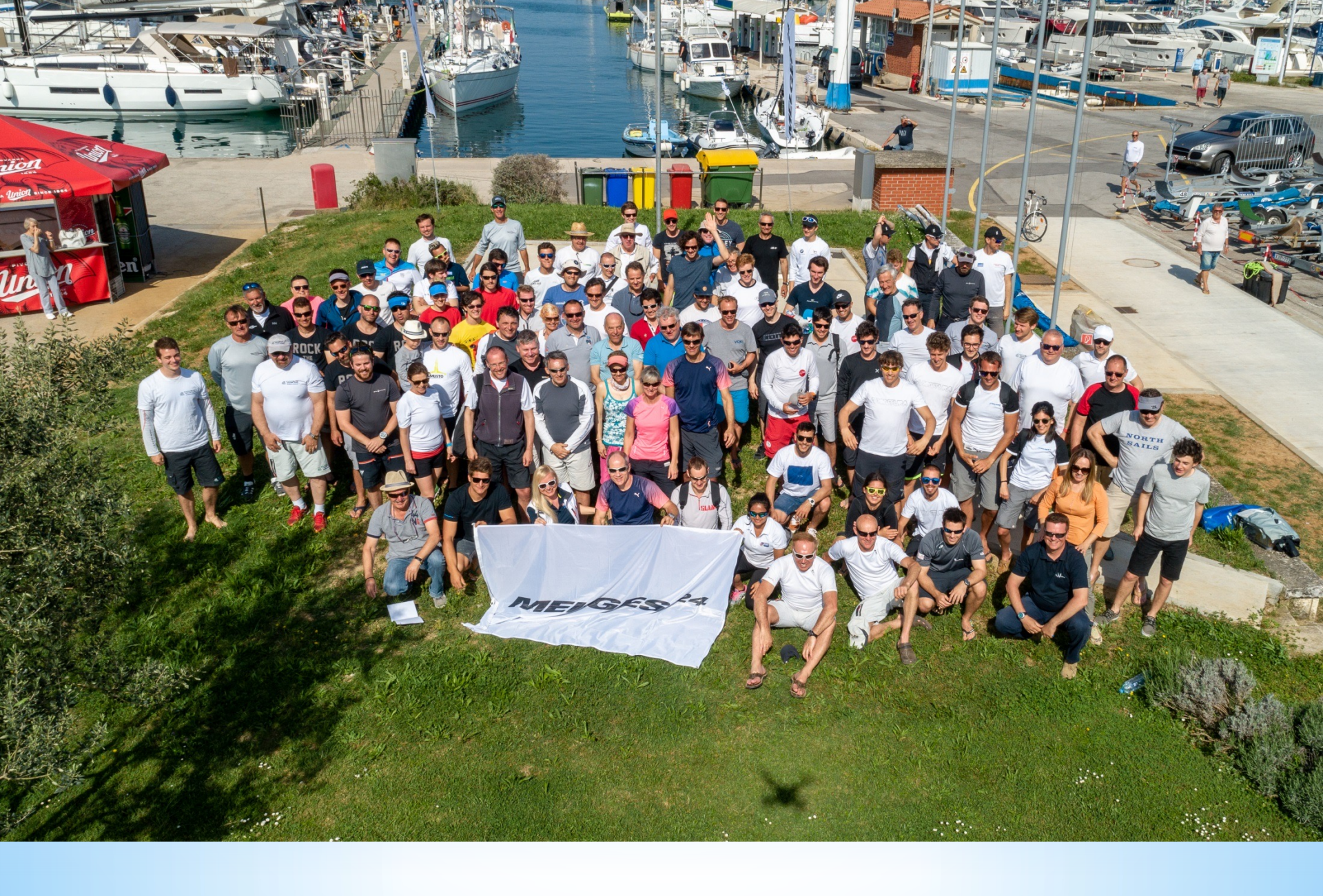
See you all in Portorož